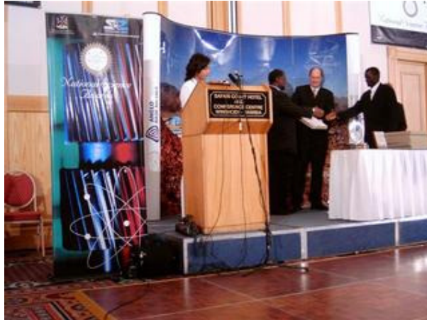
Back at the conference...