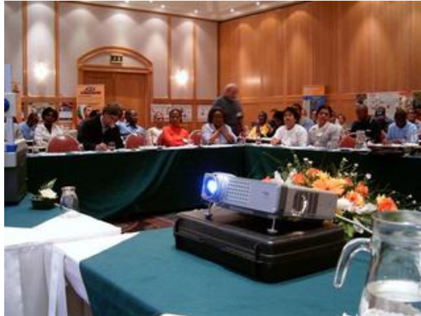
The Conference gets under way at the Safari Court Hotel Conference Centre.