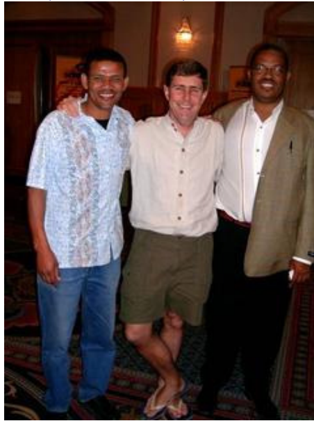
The SAASTEC Vice-President balances a lamp on his head, with a little help from his friends.