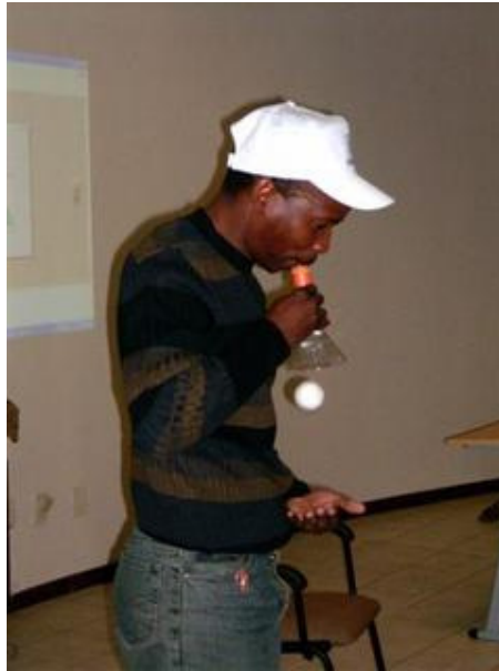
Amazing science in action.