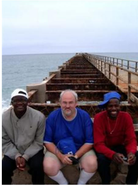
Post-conference relaxation on the pier at Swakopmund. The effect of the chilly Atlantic is evident.