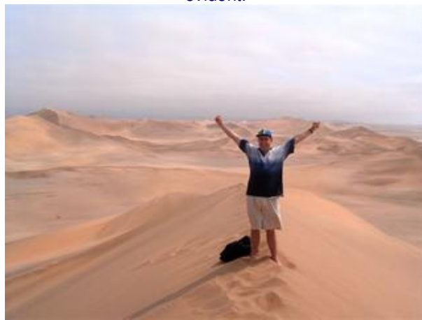
Post-conference relaxation on the dunes at Swakopmund. Namibia is a stunning tourist destination, the enormous sand dunes of the Namib desert being one of the attractions.