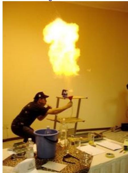
The highlight of the conference.