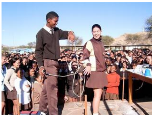
Demonstration at a school before the conference.

The photographs below provide an impression of proceedings.