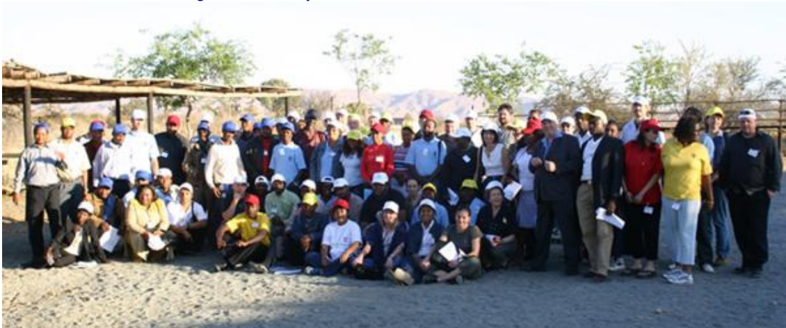
Group photograph of the assembled delegates at the Heja Ranch.