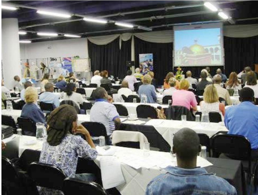
This general view shows the large space available at the Old Mutual-MTN ScienCentre for holding the conference.