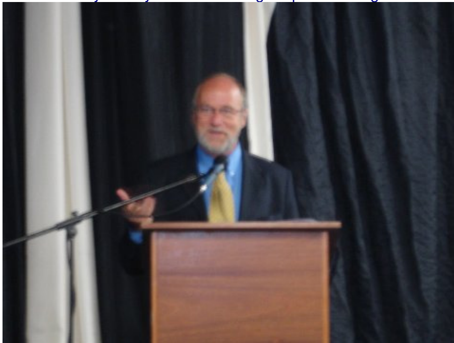
Science and Technology Deputy Minister Derek Hanekom provided the keynote address at the official opening on Wednesday morning.