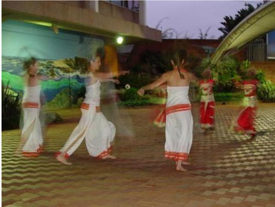
After a long but interesting day, the Natal Shark Board hosted the delegates for drinks and supper. A fusion dance group provided pleasant entertainment as the delegates relaxed.