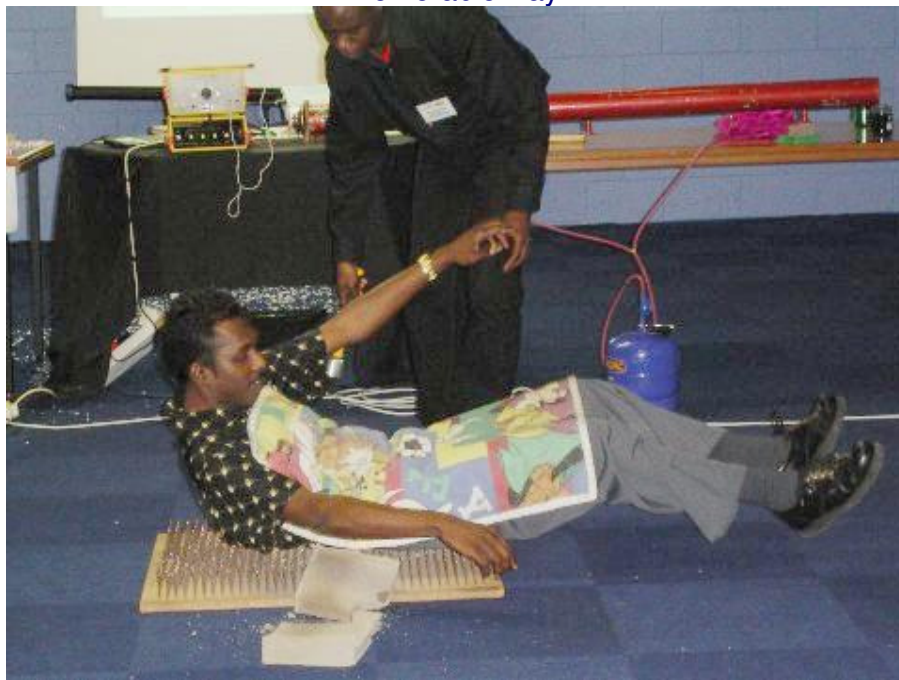
Their finale was using a large hammer to break a block of cement resting on the chest of one of them, while he lay on a bed of nails. He really did get up and walk away afterwards, but do not try this at home folks! These are highly trained professionals!